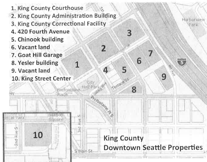
Figure 2. King County Downtown Seattle Properties

Though not specifically identified in the proviso, FMD recommends the inclusion of the King Street Center (KSC) in the Downtown Campus planning process due to its close proximity and the importance of the county KSC tenants in the larger context of the long term service delivery vision/mission of the County.