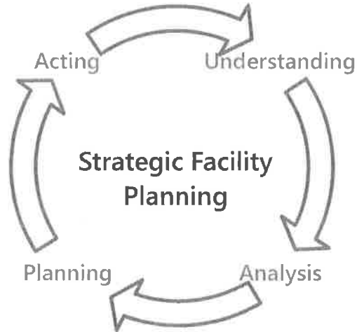
Figure 1. SFP Process